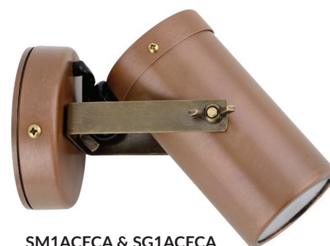
SM1ACECA & SG1ACECA