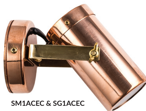
SM1ACEC & SG1ACEC